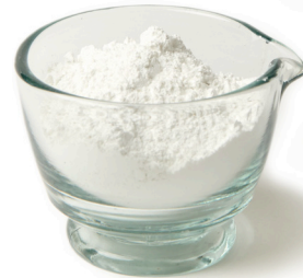
A BASE Lime - Calcium Hydroxide

In order for the reducing agent to act on the indigo, a basic environment is required. Chemically speaking, a base is the opposite of an acid. The reduction of indigo requires a basic (alkaline) solution. A recommended base for an indigo vat is calx (calcium hydroxide) also known as lime, pickling lime, or hydrated lime. Do not confuse it with “quick lime” (calcium oxide) which is much more corrosive, or chalk (calcium carbonate) which is too mild a base for an indigo vat. Maiwa sells a high grade calx, perfect for making a vat. Soda ash or lye are alternatives to calx. Lye is a strong base and should be treated with caution. Soda ash is less caustic than lye and is a good alternative but it takes longer.