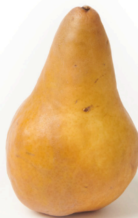
A REDUCING AGENT