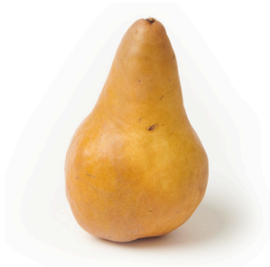
A REDUCING AGENT eg. Ripe Fruit

Chemically, we need to reduce the indigo to make it soluble — we do this with a reducing agent.