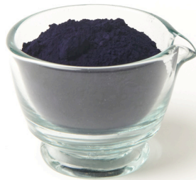
INDIGO Powdered Indigo

We recommend natural indigo extract in powdered form. Natural indigo generally contains anywhere from 15% to 55% indigotin by weight depending on the crop, growing season and harvest. Maiwa's natural indigo generally tests at between 40 and 45% indigotin. In a well maintained vat, 15 grams of indigo will dye approximately 450 g (1 pound) of fibre a dark blue. It will dye 900 g (2 pounds) of fibre a medium blue.