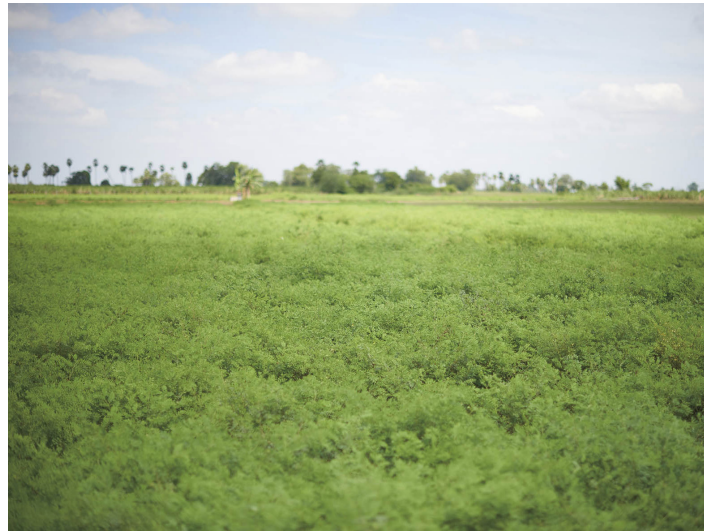
Fields of indigo growing in South India

Indigotin (the dye component of indigo powder) is insoluble in water. To use it for dyeing it must be reduced to a water-soluble form.