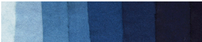
Eight shades of indigo on wool. Dyed using an organic banana vat.