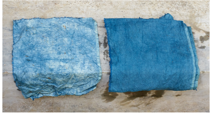
A single length of cloth torn in two. Scoured on the right, not scoured on the left.